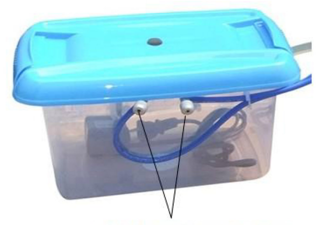
Valve for adjusting water flow