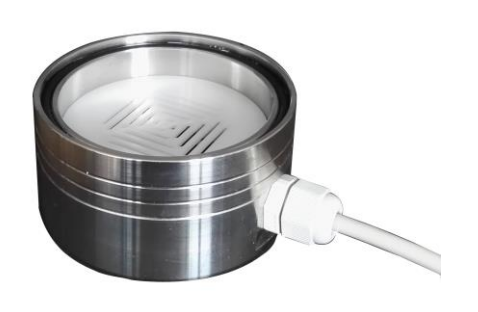
Figure 6 Figure 7