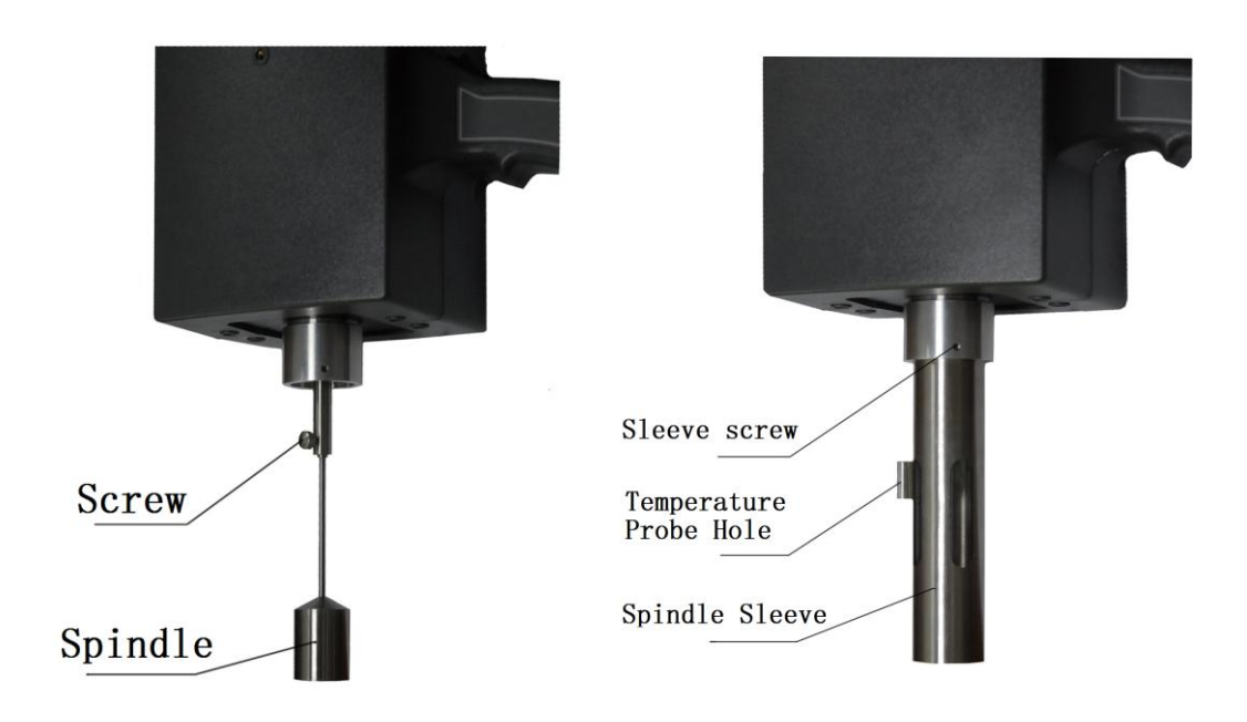
BGD 160 series portable digital viscosity measuring instrument Spindle installation diagram