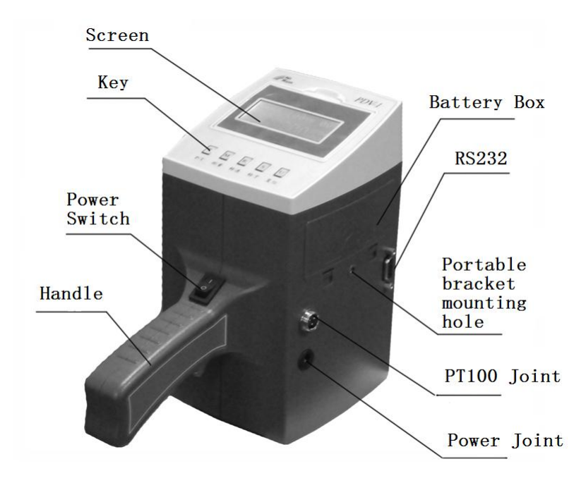
BGD 160 series portable digital viscosity measuring instrument schematic diagram