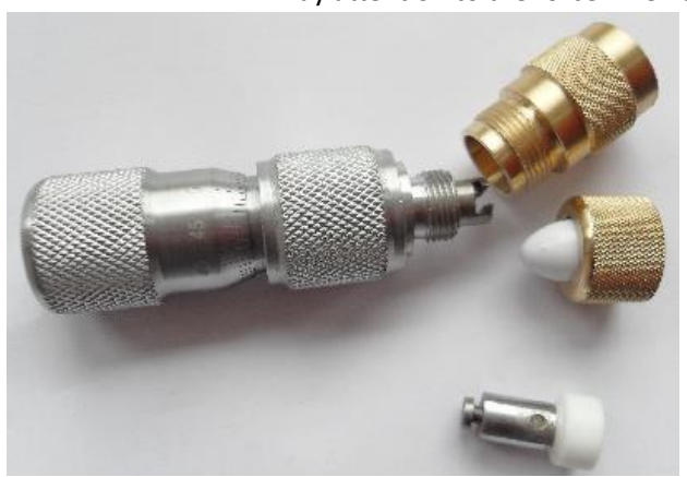
Pay attention to the force when separate r in order not to damage the internal components.

3. Then screw off each parts and clean them with white gas or petrol. After cleaning, assemble each part to the right position. Be careful to use and maintenance.