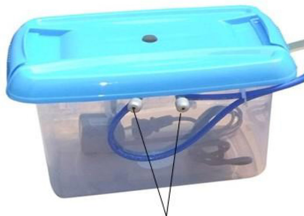
Valve for adjusting water flow

5.2.7 Power on the “Pump” and adjust the valve for flow, control the flowing speed of washing liquid is approx. 0.04 ml every second.