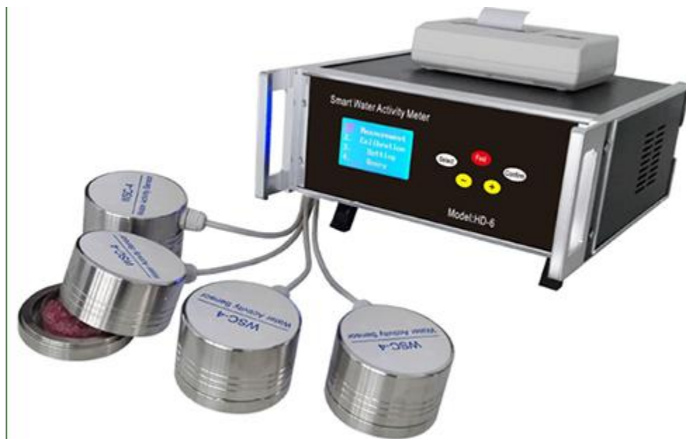
Smart Water Activity Meter Model: HD--6